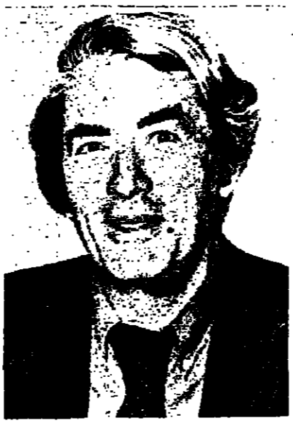
Film actor Gregory Peck arrived in Israel yesterday in order to visit the movie village erected near Patah Tzvi...